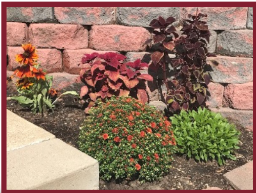
Photos from the front gardens at Grundy Center Elementary.