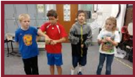
Students working in teams to perform instrumental ostinatos (repeated patterns).