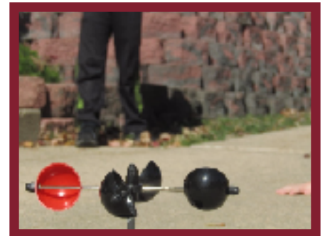
First graders learning about Air and Weather utilizing the FOSS Science kits! Here we are experimenting with some tools meteorologists use; anemometer, wind vane, and bubbles.