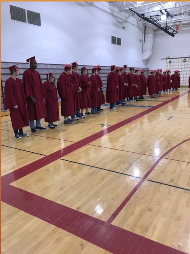
Members of the Grundy Center Community School Class of 2017 walked the hallways of the elementary building and told us their future plans. Thanks for coming!